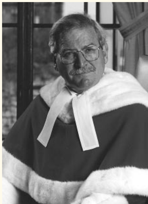
The Right Honourable Antonio Lamer, P.C., C.J.C. 1990–