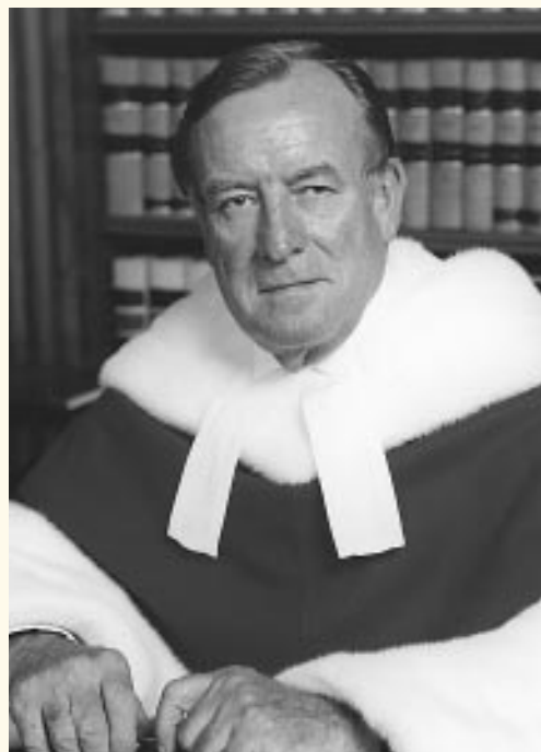
The Right Honourable R.G. Brian Dickson, P.C., C.J.C. 1984–1990