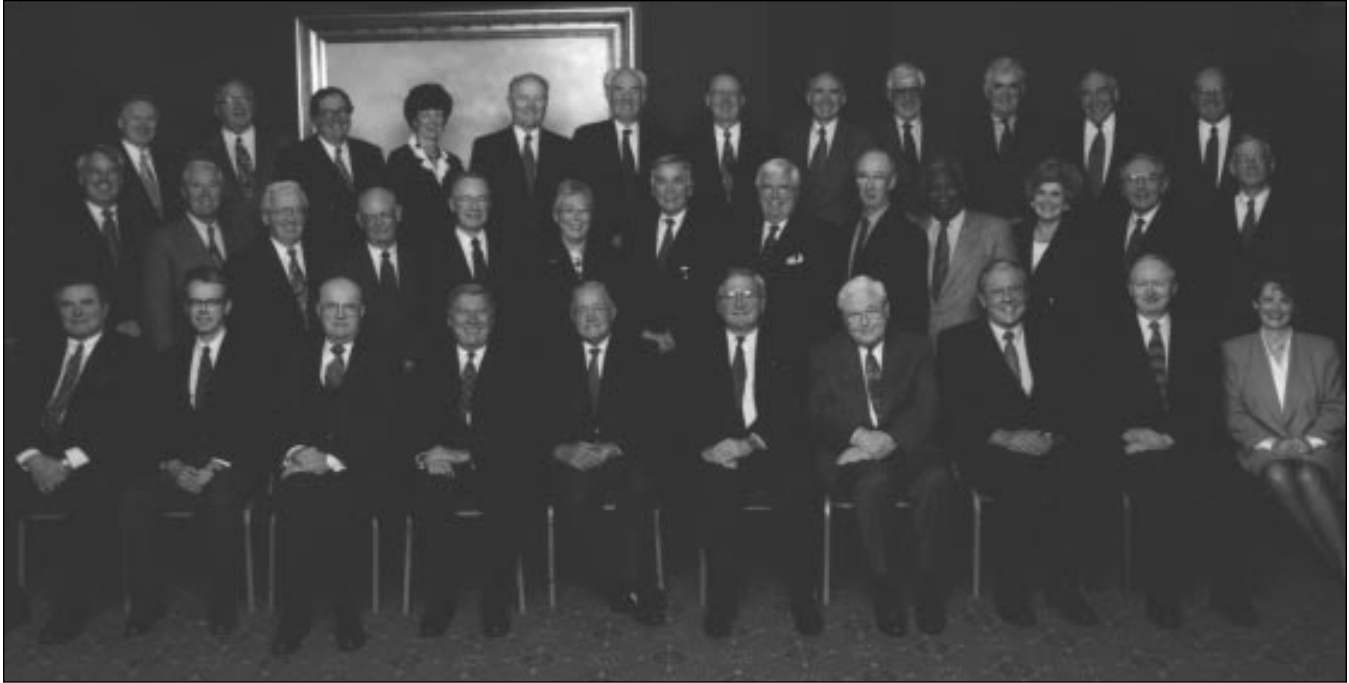
Members of the Canadian Judicial Council at the September 1996 Annual Meeting in Halifax

Its birth had been somewhat difficult, its youth had known disquieting jolts at times, but the organism was now possessed of sufficient vitality to justify its adoption by the Legislature. . . . the foundations were laid for the organization of the Canadian Judicial Council which was to see the light of day on the 9th day of December, 1971.