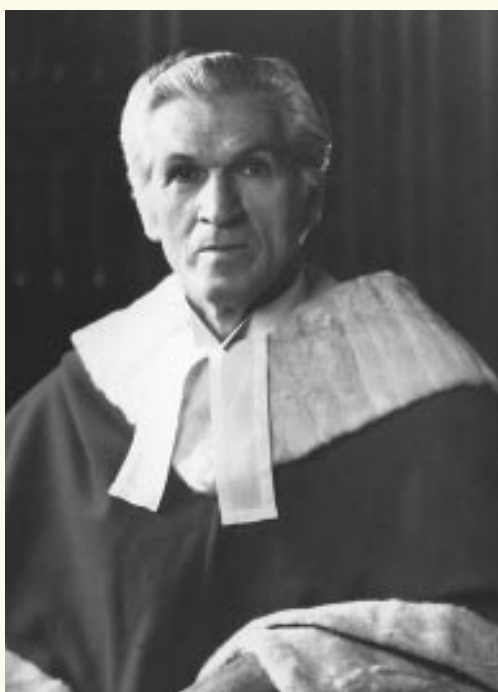
The Right Honourable Bora Laskin, P.C., C.J.C. 1973–1984