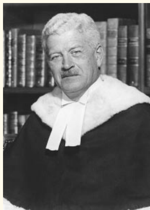
The Right Honourable Gérald Fauteux, P.C., C.J.C. 1971–1973